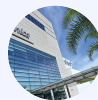
Tamboré Sao Paulo (Brazil)